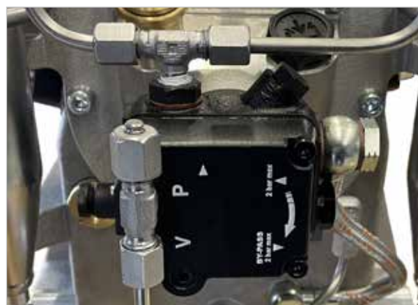
NEW - Adjustable oil pump with oil sieve