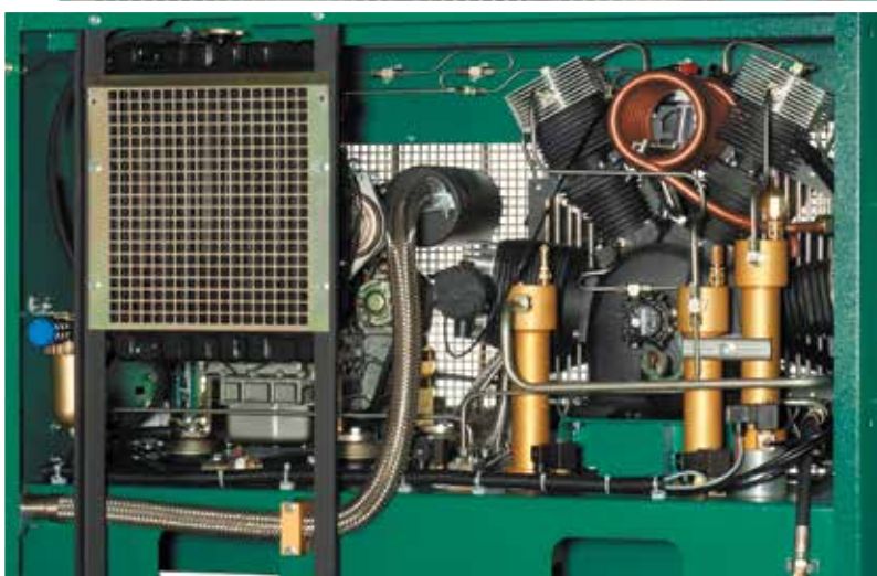
LW 570 D Rear view